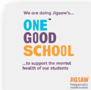
General social media post image for use on Facebook, Instagram and Twitter

For information, support, or just to find out more about what we do, visit jigsaw.ie